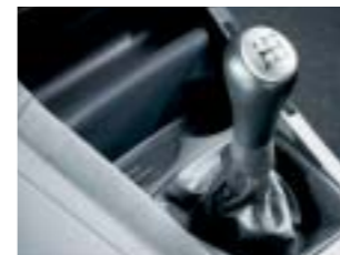
6 speed manual transmission (1.4 16v engine only).