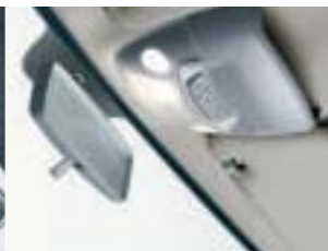
Front, central ceiling mounted document pocket.