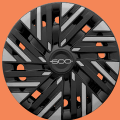
Standard Wheel 16" Steel Wheels with Covers