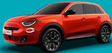
Orange - Sun