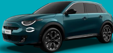
Green - Sea