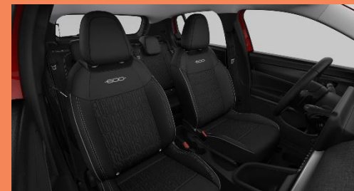
Standard Upholstery Black Recycled Fabric Seat Upholstery with Fiat Monogram