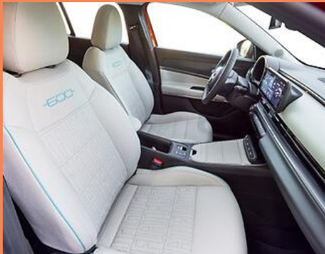
Standard Upholstery Full Ivory Fiat Monogram Leather Seat Upholstery

All pictures for illustration purposes only