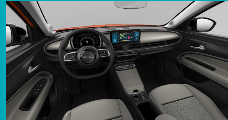
Green – Sea Sand – Earth