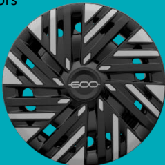
(RED) Standard Wheel 16" Steel Wheels with Covers