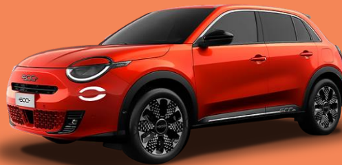
Orange - Sun