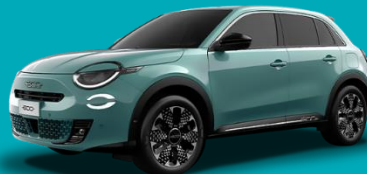
Blue - Sky