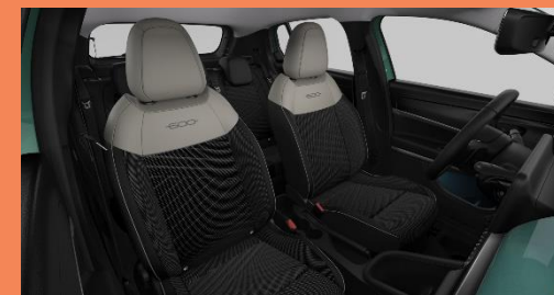
Black & Ivory Recycled Fabric Seat Upholstery with Fiat Monogram