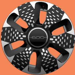
Standard Wheel 18" Alloy Wheels Diamond Cut