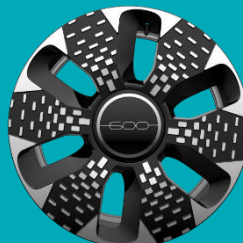
La Prima Standard Wheel 18" Alloy Wheels Diamond Cut