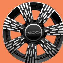
Standard Wheel 17" Alloy Wheels Diamond Cut