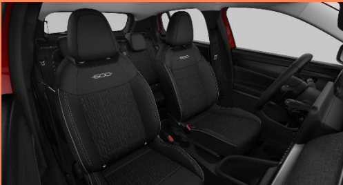
Standard Upholstery Black Recycled Fabric Seat Upholstery with Fiat Monogram

All pictures for illustration purposes only