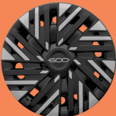
Standard Wheel 16" Steel Wheels with Covers