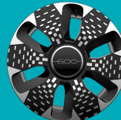
La Prima Standard Wheel 18" Alloy Wheels Diamond Cut