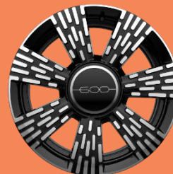
Standard Wheel 17" Alloy Wheels Diamond Cut