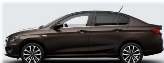
Magnetic Bronze (5CC / 444)