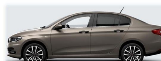
Pearl Sand (5DS / 722)