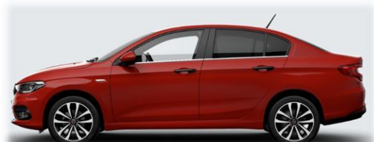
Passion Red (6Y3 / 168)