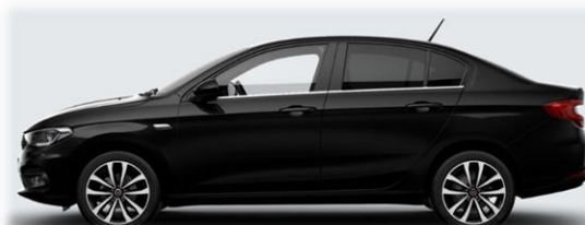
Volcano Black (5CD / 718)