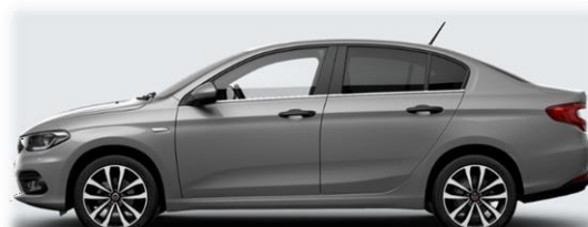
Minimal Grey (5DQ / 612)