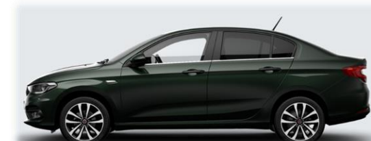
Tuscany Green (6Y2 / 651)