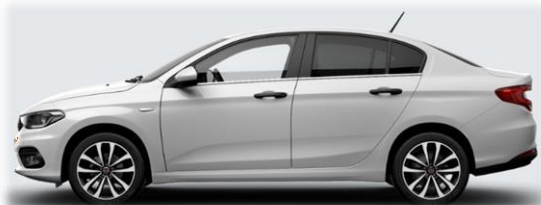
Ambient White (5CA / 249)