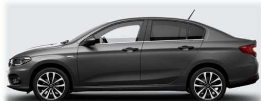
Electroclash Grey (5DR / 695)