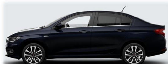
Elba Blue (5CE / 717)