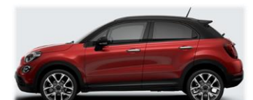
Amore Red (74F / 734)