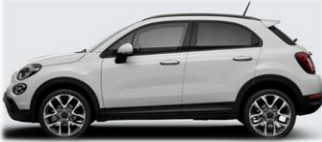
Ice White (5CA / 296)