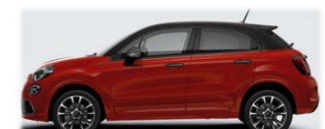
Sport Red (5CG / 686)