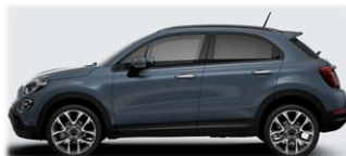
Blue Jeans (5DR / 731)