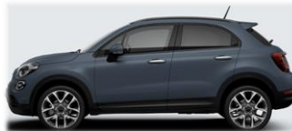
Jeans Blue (5JQ / 994)