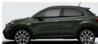
Techno Green (61Q / 019)