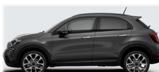
Fashion Grey (5DT / 679)