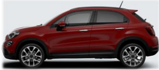
Passione Red (7AZ / 289)