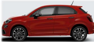
Sport Red (5CF / 176)