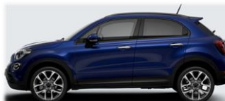
Venezia Blue (5DP / 888)