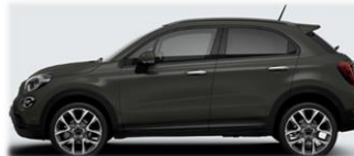
Marching Green (8CZ / 149)