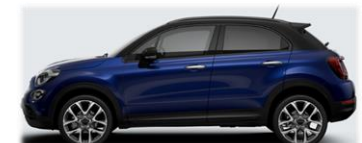
Venezia Blue (5CH / 158)