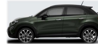
Techno Green (10N / 749)