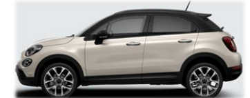
Ivory (0SB / 521)