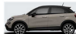
Cappuccino Beige (74G / 812)