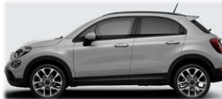
Argento Grey (5CC / 348)