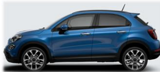
Italia Blue (5CC / 018)