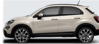
Ivory (6FX / 020)