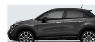
Fashion Grey (5CL / 170)