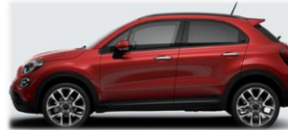
Amore Red (61P / 942)