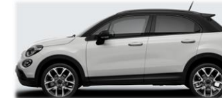
Ice White (0PY / 317)