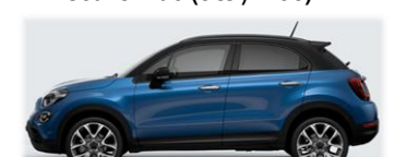
Italia Blue (4SA / 737)