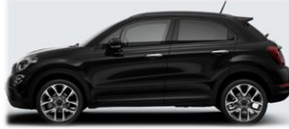
Cinema Black (5CK / 601)