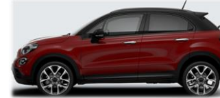
Passione Red (6FW / 941)