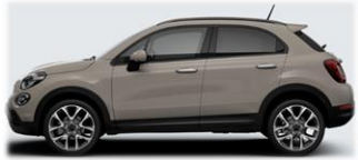
Cappuccino Beige (5DM / 231)