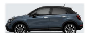
Jeans Blue (5CJ / 160)