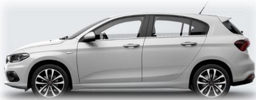
Ambient White (5CA / 249)