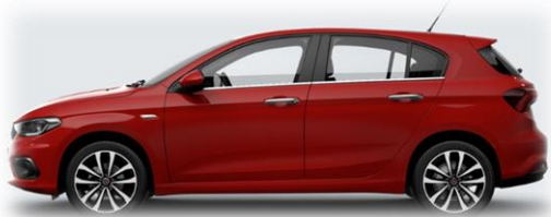
Passion Red (6Y3 / 168)