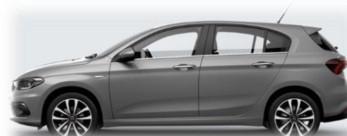
Minimal Grey (5DQ / 612)