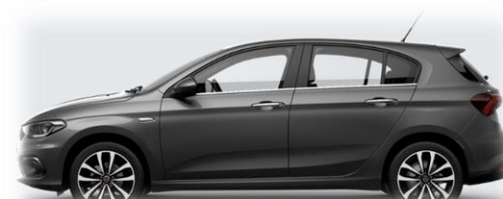
Electroclash Grey (5DR / 695)