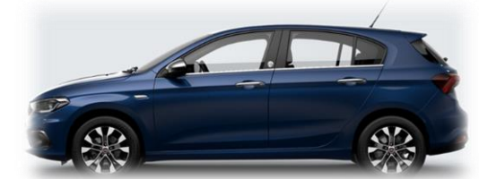
Mirror Blue (5DT / 515)