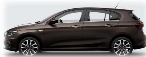
Magnetic Bronze (5CC / 444)