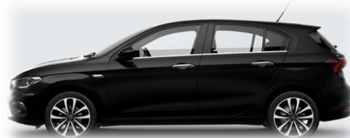
Volcano Black (5CD / 718)