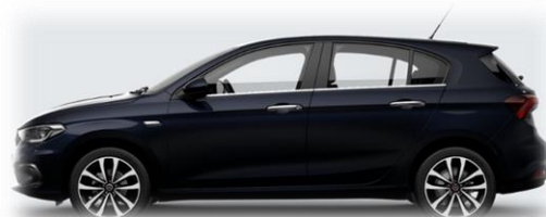
Elba Blue (5CE / 717)