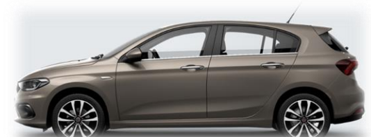
Pearl Sand (5DS / 722)