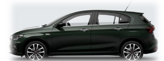
Tuscany Green (6Y2 / 651)