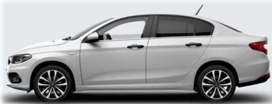
Ambient White (5CA / 249)