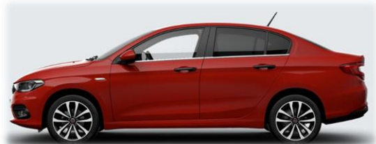
Passion Red (6Y3 / 168)