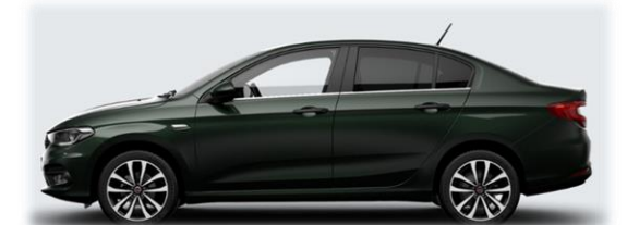
Tuscany Green (6Y2 / 651)