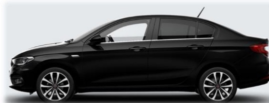
Volcano Black (5CD / 718)