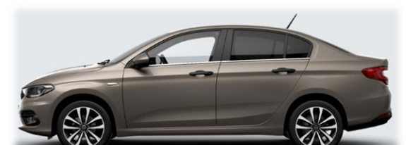
Pearl Sand (5DS / 722)