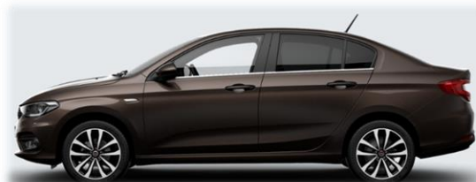
Magnetic Bronze (5CC / 444)